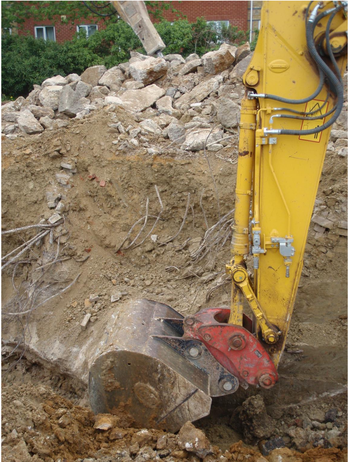
Plate 2. Showing removal of deep reinforced concrete foundations