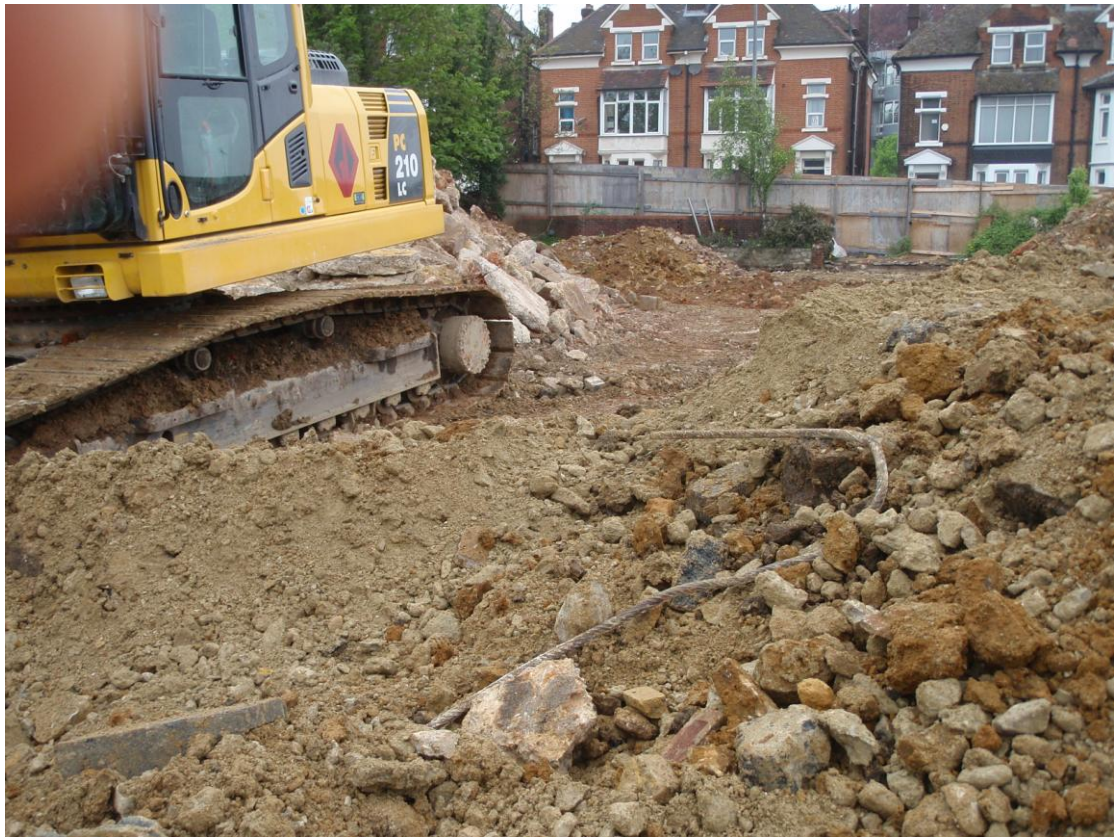
Plate 1. Showing on-going site clearance and looking towards Tonbridge Road