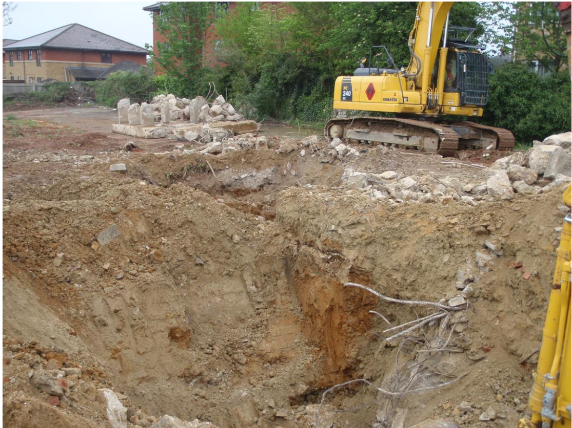
Plate 3. Most of the site was excavated to remove concrete foundations